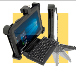
Vehicle Mount plus rugged keyboard